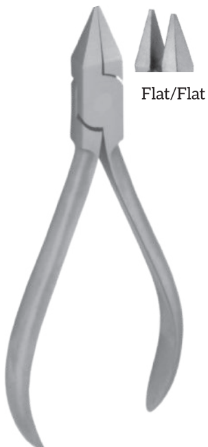
6704 Square Beak - Small • .014" to .028" ■ Max .022" x .028" 12.5cm