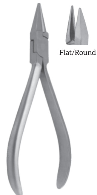
6706 Bird Beak - Long • .014" to .028" ■ Max .022" x .028" 13cm