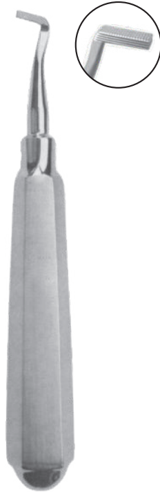
6901 Mershon 14.5cm