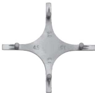
6903 Positioning Gauge