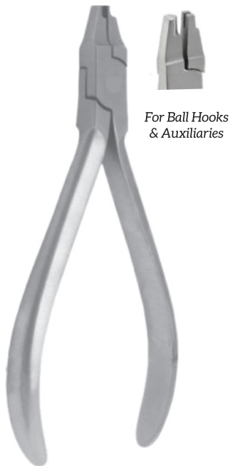
6604 Hook Crimping Plier 13cm