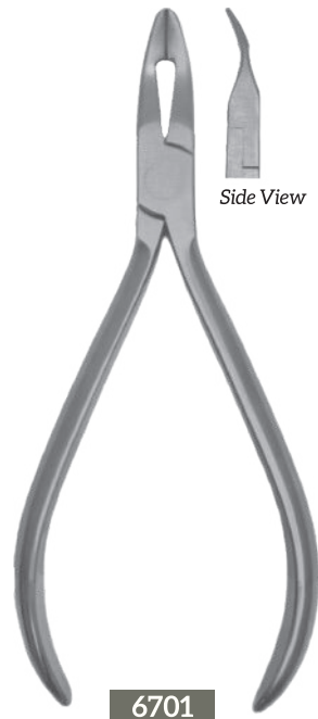
6701 Weingart • .012" to .020" ■ Max .022" x .028" 12.5cm